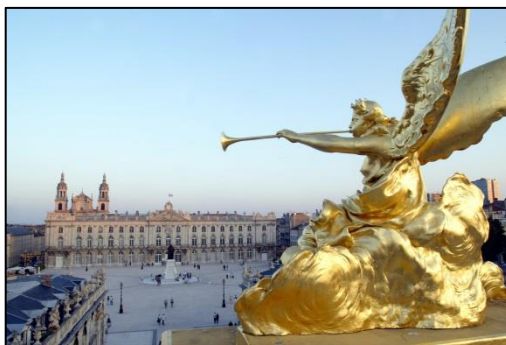
Place Stanislas et Renommée