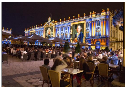
2013 RDV 2@Ville_de_Nancy